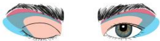
Eyes with a single eyelid, commonly appearing in Asian eyes, appear as a flat surface when closed due to a lack of a natural crease.

To create the illusion of a larger eyelid, apply Shade 3 in a large sideways 'V' shape, starting from the inner eye corner, just above the eye crease and sweeping back to outer third of upper lashline. Then sweep the same shade along the outer third of the lower lashline. Finally, apply Shade 2 along the brow bone.