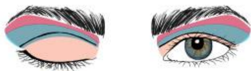
Eyes with an eyelid that is not readily seen.

To add dimension to the eyes and give the illusion of a deeper eye crease, apply Shade 3 along the top of the entire length of the eye crease and blend upward almost to the brow. Then apply Shade 2 along brow bone instead of the eyelid.