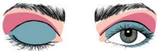
Eyes that are set deep with a prominent brow bone

Trace a line from inner corner of the eye crease to the brow bone with Shade 2. Continue applying along brow bone and finish by applying under outer lower third of the lashline. Then apply Shade 3 to the crease, focusing on the outer corner of the eye.