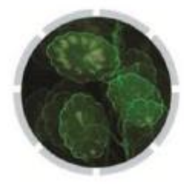
Plant Stem Cells