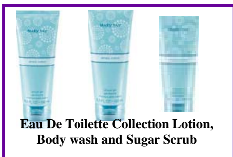
Eau De Toilette Collection Lotion, Body wash and Sugar Scrub